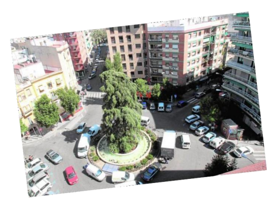
"Costasol", in Ciudad Jardín

Links to Accommodation service at UCO (Colegio Mayor Universitario): http://www.uco.es/servicios/informacion/alojamiento