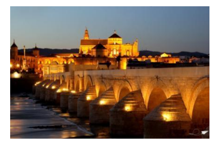
• Roman Bridge