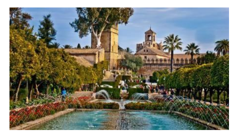
• Alcázar de los Reyes Cristianos