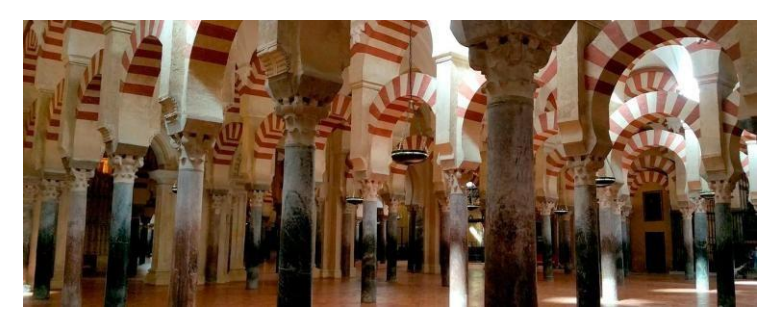
• Mezquita-Catedral (Mosque-Cathedral)